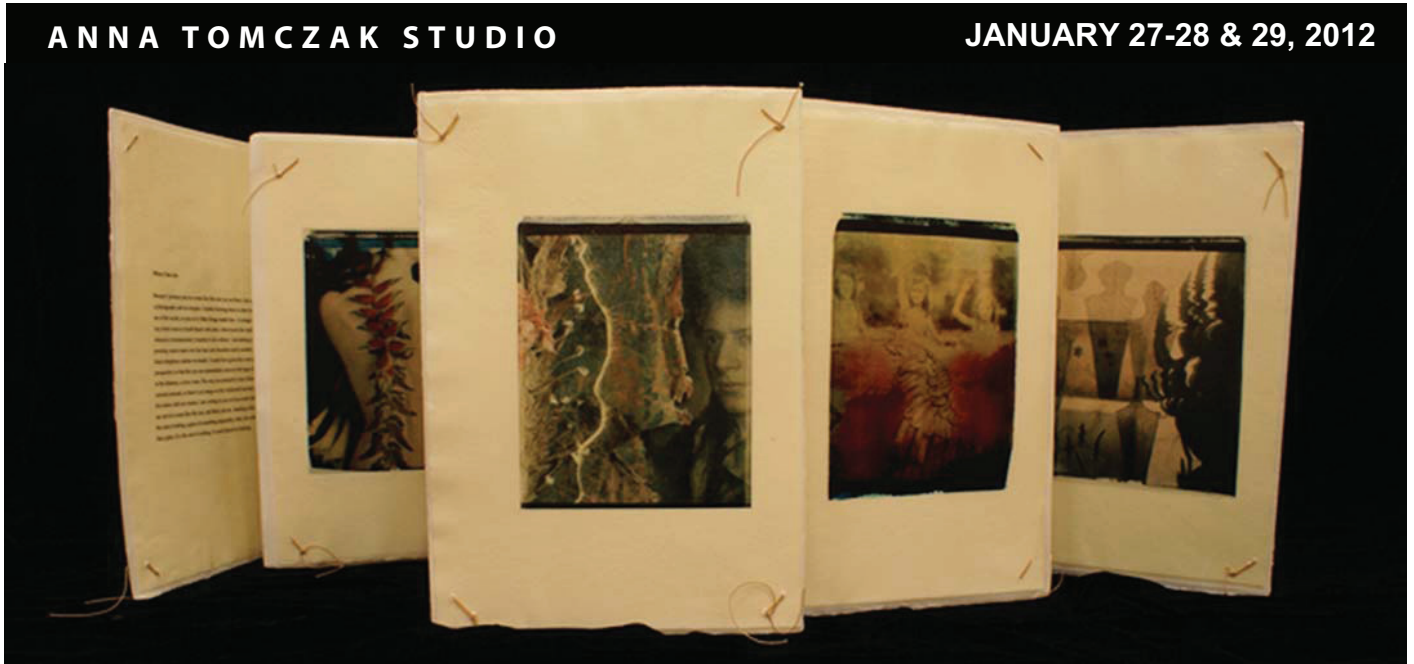
"Blue Dresses, White Lillies" Artist Book by Anna Tomczak, poetry by Silvia Curbelo

This workshop is designed as a continuation of previous bookmaking and alternative process workshops at my studio. New and former students are welcome. We will concentrate on the various methods of integrating photographs into the surface of various art papers, cloth, canvas and metals. The intent is to express a visual idea in the form of a unique book with wide creative latitude. A variety of binding styles (coptic stitch will be shown at this time) and bookmaking methods will be demonstrated and/or discussed. Non-silver processes will be emphasized including blue print, photocopy transfers, Polaroid emulsion lifts, hand painting and acrylic transfers.